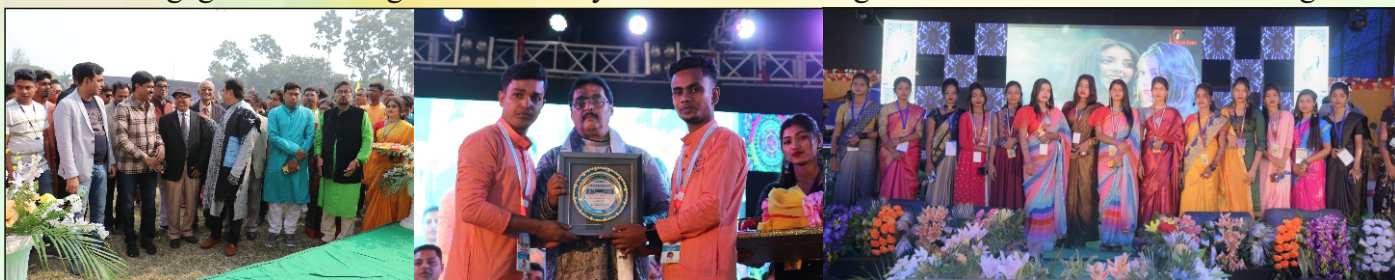
Celebrating Twenty Five years