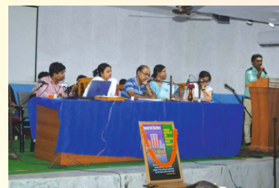
The Judges of Debate Competition in Bhasha Debas, 2017

COURSE OFFERED : BPP: (Bachelor Preparatory Programme.) 6 Months duration