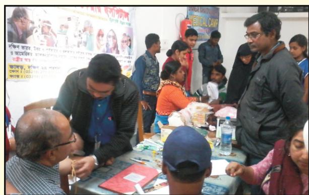
Health Camp (NSS) in Collaboration with IQAC