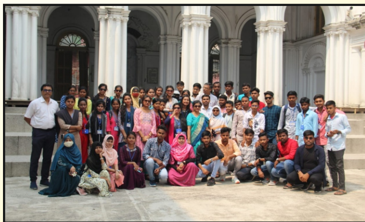
Excursion of the Dept. of History

The Department of Bengali had brought out an ISBN Book called 'Along Sahitya'. The Department of Bengali also had brought out its National Seminar Proceedings. The Department of English had