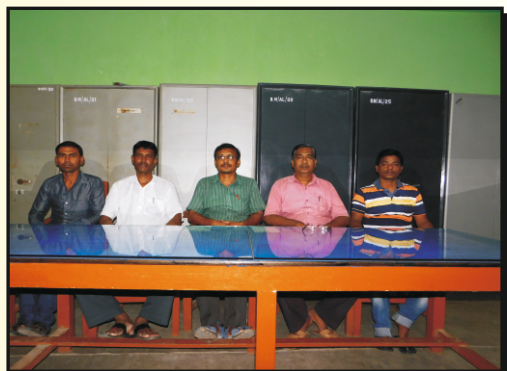
NSOU Co-ordinator & Staff

COURSE OFFERED : BPP: (Bachelor Preparatory Programme.) 6 Months duration