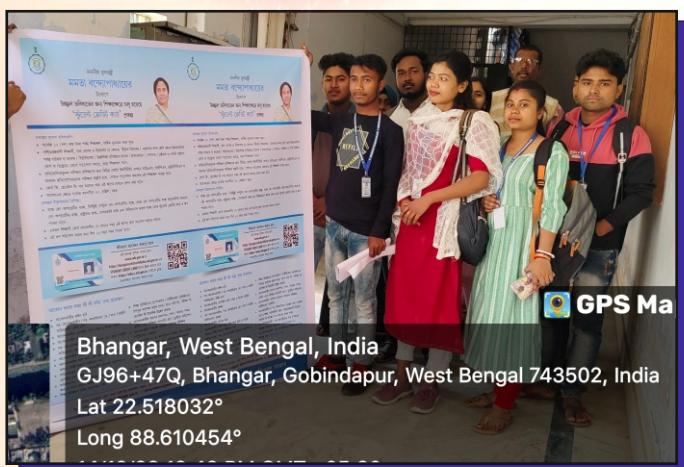
Students Credit Card