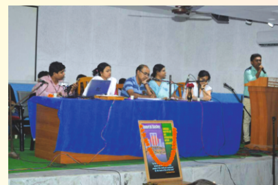
The Judges of Debate Competition in Bhasa Debas, 2017

COURSE OFFERED : BPP: (Bachelor Preparatory Programme.) 6 Months duration