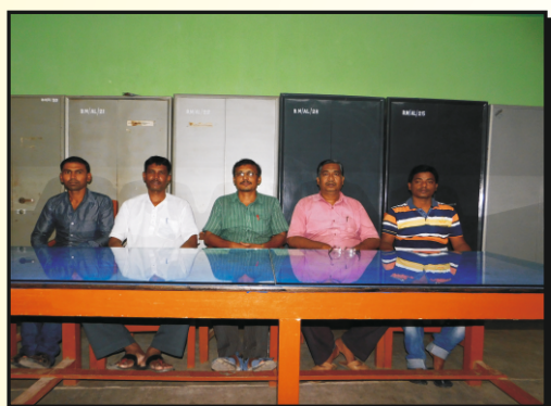
NSOU Co-ordinator & Staff

COURSE OFFERED : BPP: (Bachelor Preparatory Programme.) 6 Months duration