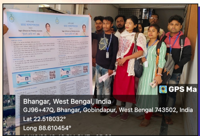
Students Credit Card