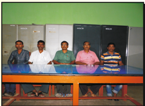
NSOU Co-ordinator & Staff

COURSE OFFERED : BPP: (Bachelor Preparatory Programme.) 6 Months duration